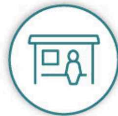
Public Transportation and Rail

The results from this survey and the draft plan will be available for review in March. Check the project webpage at https://engagegaston.com/gaston-CTP for updates!