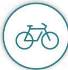
Bicycle and Pedestrian